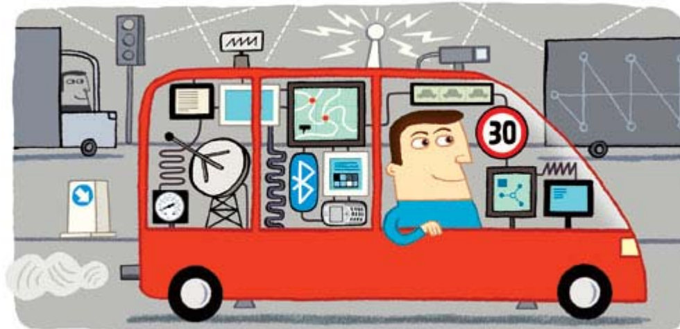
Illustration by Allan

Cars are becoming more connected, both to remote systems for navigation and information, and to each other